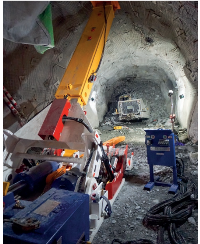
12. View of the buried asset from the rear of the MED360.