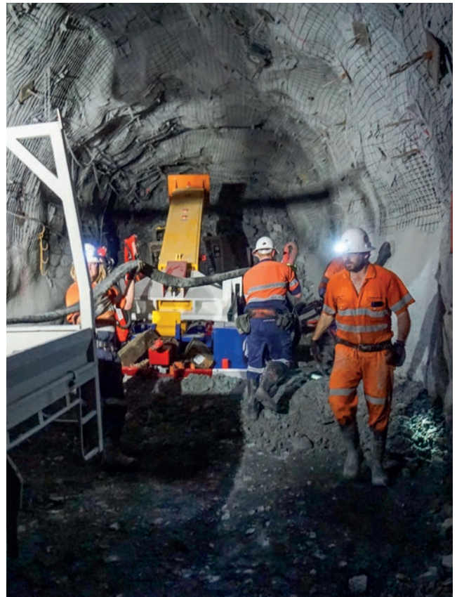
3. The tow slings and other equipment are moved into position.