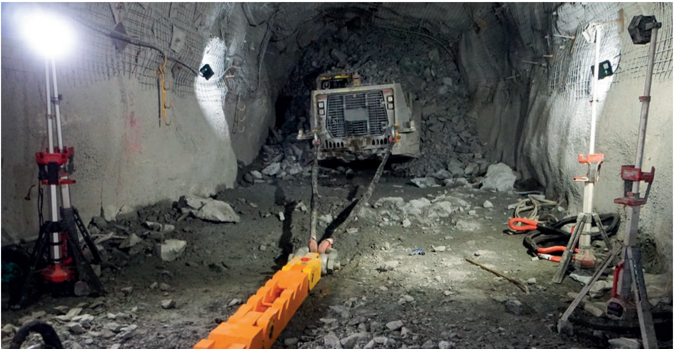
16. Tension is applied to the tow slings and the extraction process commences.

If you require further information on the Elphinstone range of MED products, please visit www.elphinstone.com or the contact email addresses provided.