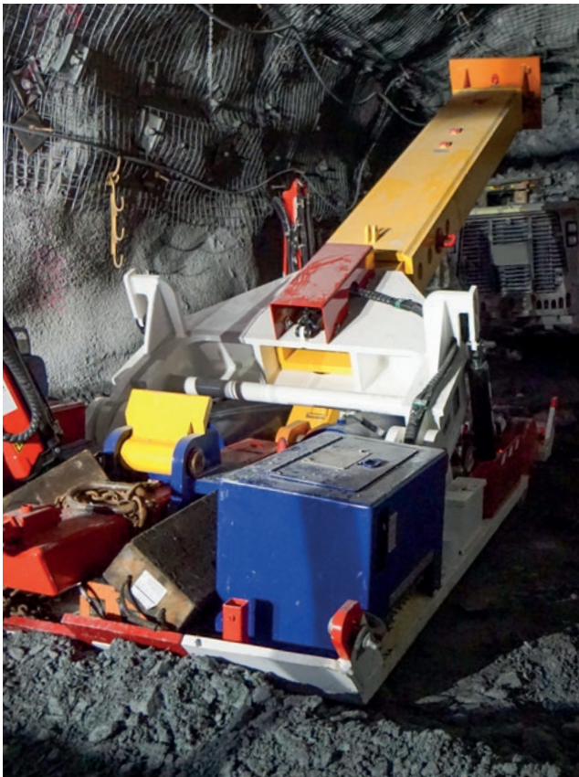
2. The MED360 is positioned over the prepared base.