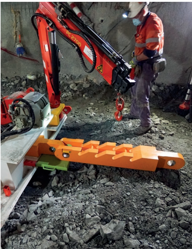
9. Racks are being located and pinned together using the front Hiab. (Hiab cranes are only available on the MED360).