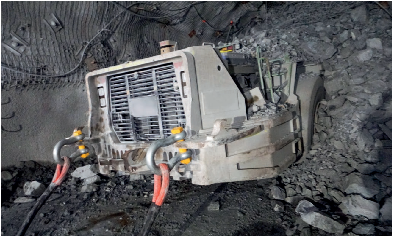
15. The tow slings are attached to the 'D-shackles' and readied for the machine extraction.