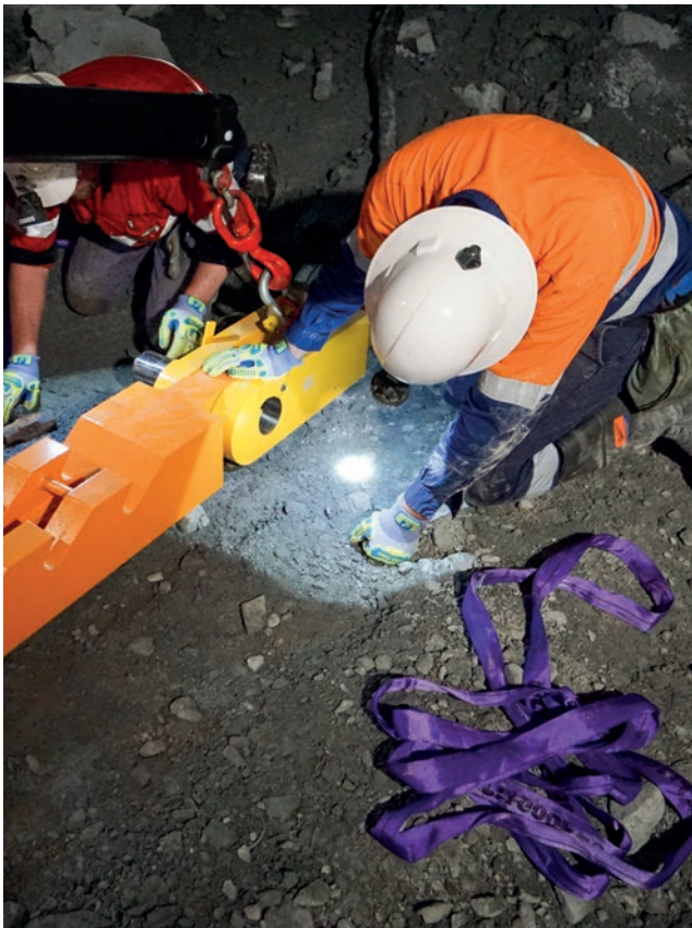
13. The connecting link is secured to the pulling rack using the load pin.