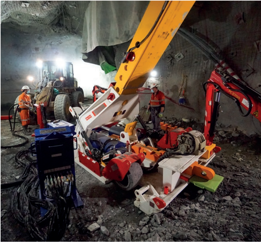
7. The control station and hydraulic hoses are moved into position and connected. In this case the auxiliary implement controls on an IT loader are used to operate the MED.