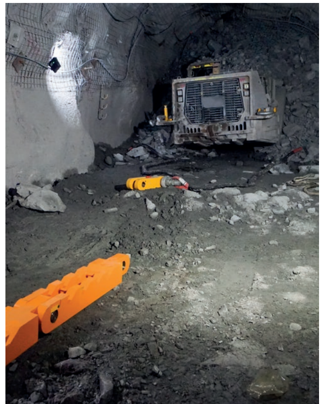
10. Tow sling is secured to the buried asset using rated 'D-shackles' and tow slings.