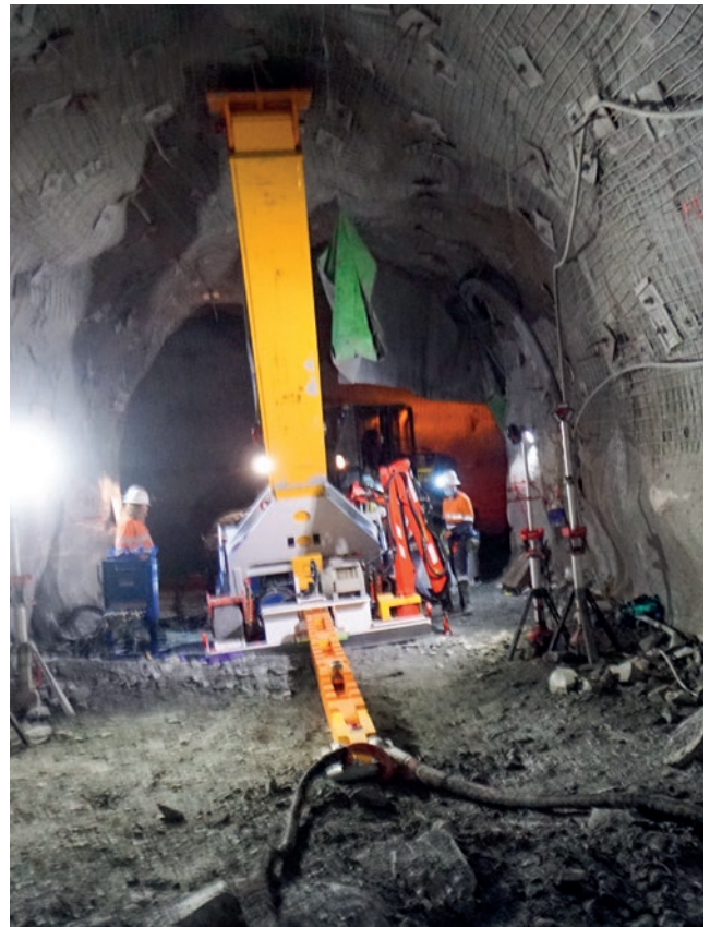
14. The MED360 is ready to commence the bedding in process and subsequent extraction.