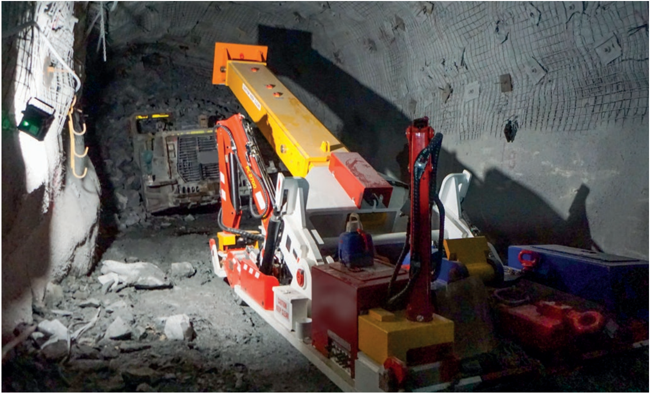
1. MED360 is being moved into place following the preparation of a solid and level base before the extraction commences.