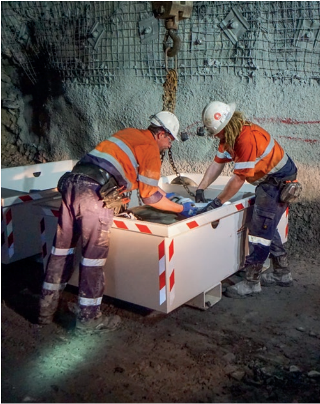
4. Correctly rated 'D-shackles' provided with the MED360 are prepared to attached to the buried asset.