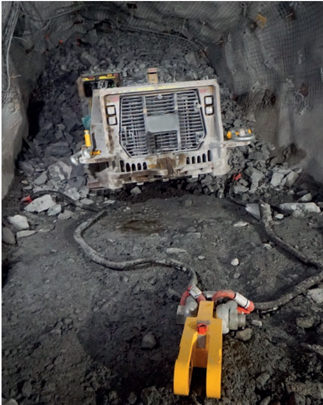
11. Tow slings have been secured to the connecting link.