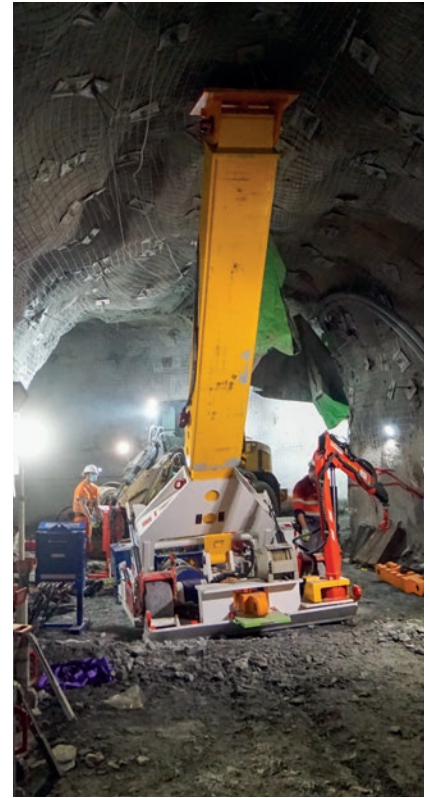
8. Boom and head plate positioned into the roof of the tunnel.