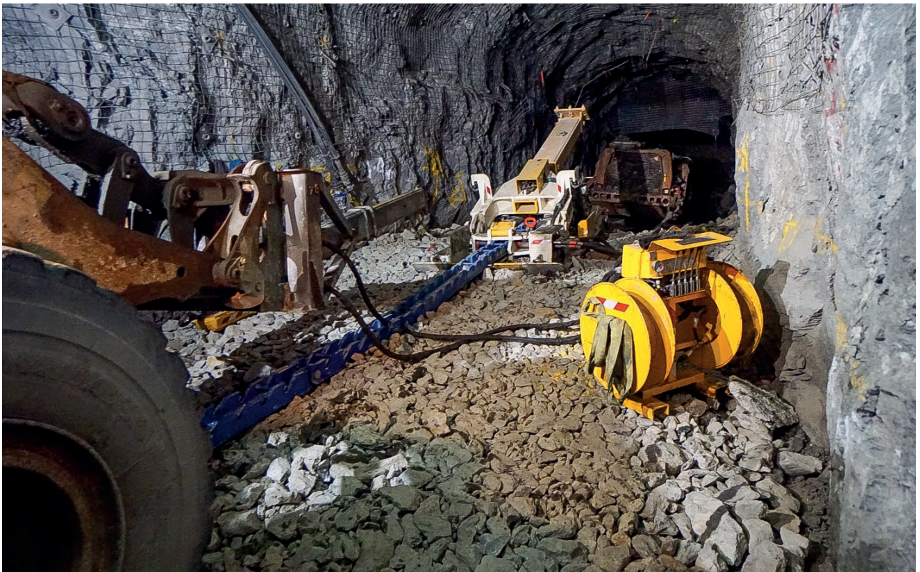
10. The extraction is managed safely and is now complete.