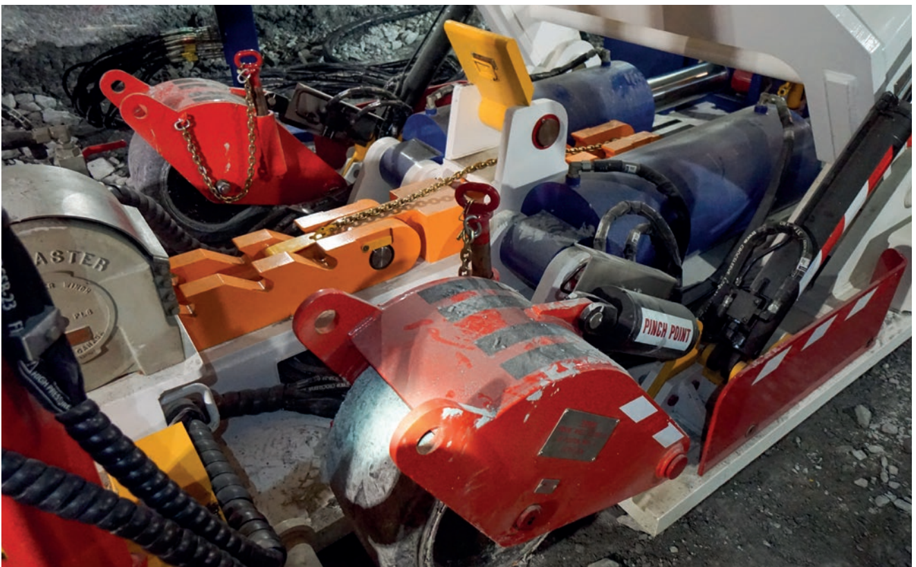
6. Image of the racks being assembled and pulled through the MED into position using the winch.