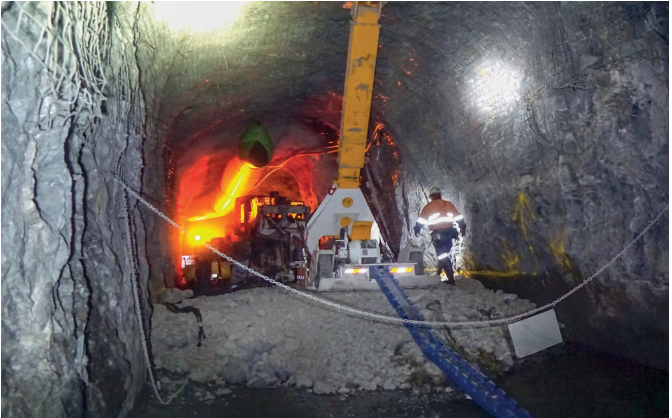
4. The engineered racks are assembled and pulled through the MED using the winch.