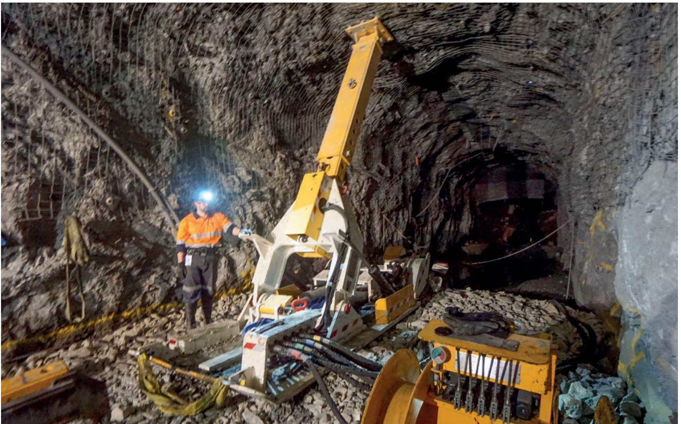
2. Now the MED is positioned on a level base, the hydraulic hoses are connected to the auxiliary implement controls on an IT loader.