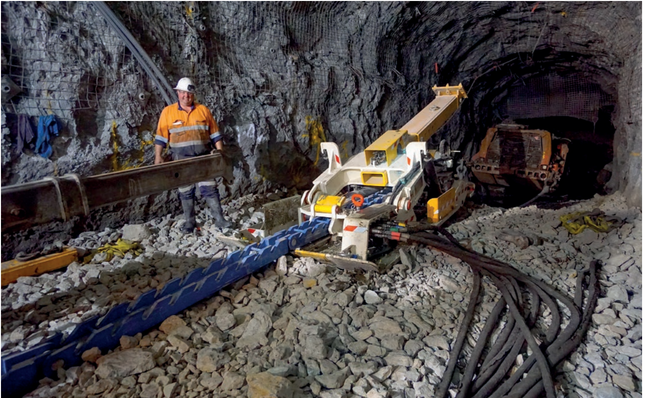
9. View of the final stages of the extraction.