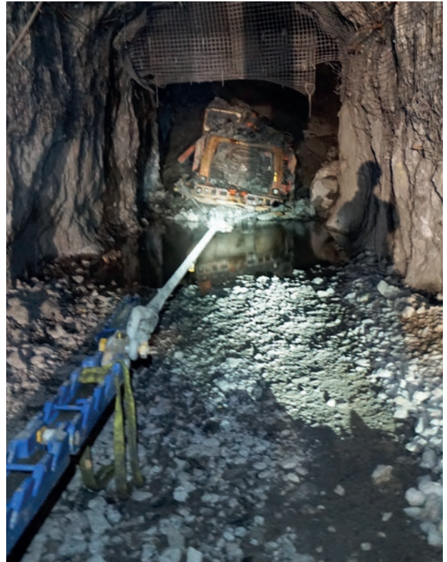
7. As the pressure is increased the machine is released from the fallen debris.