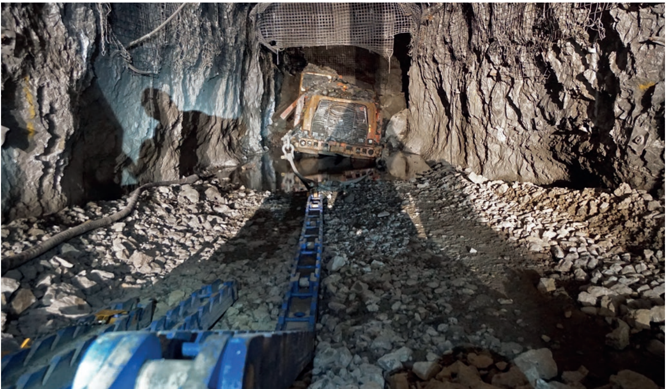
8. The MED210 works effortlessly as the machine gently ploughs through the bund.