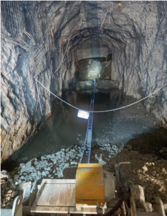
6. As the extraction commences, the pressure is applied slowly to the connecting racks and tow sling.