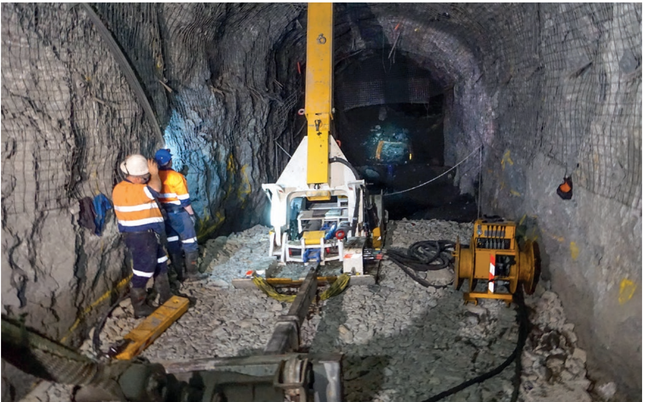
5. The connecting racks are attached to the machine using D-shackles' and slings.