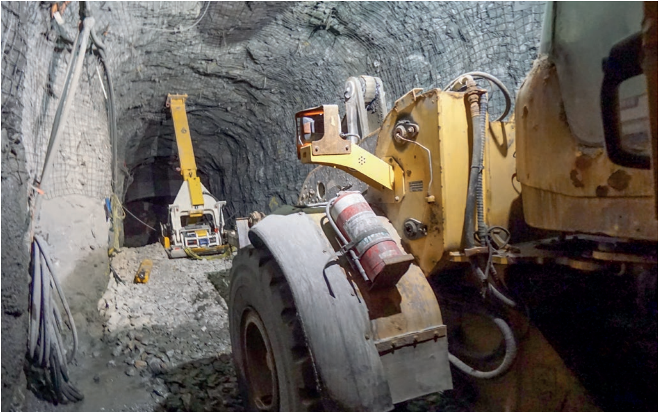
1. Following the preparation of a solid and level base, an IT loader is used to move the MED210 into place.